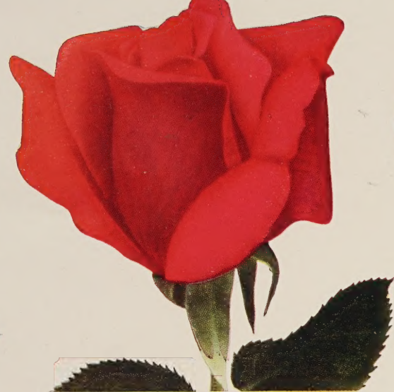
CHARLOTTE ARMSTRONG (Pat. 445)